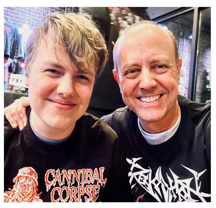
Father and son share a smile at the 2022 Cannibal Corpse concert in Birmingham, Ala., where the heavy metal band from New York was featured.

A: Winning a men's doubles tennis tournament with my dad.