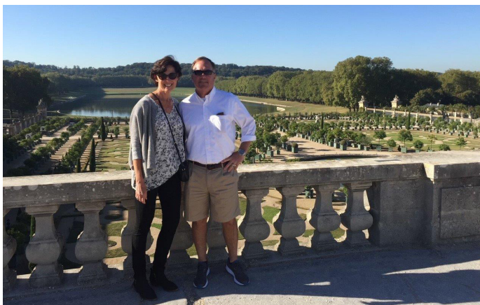
The Swanns enjoyed the magnificent Gardens of Versailles during a treasured trip to France.